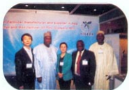
L-R: MD, Global Corp, Director of Marketing FRCN and ED, Global Corp with YIGEDA's Reps