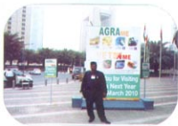
MD, Global Corp at the AGRAME venue