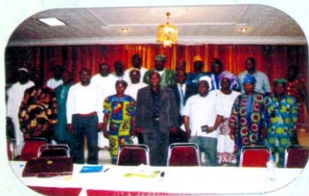
Group Photograph of Executives of Global Corp and AFAN Members

As a follow-up to our first two-day strategic meeting, which was held May 8-9, 2009, All Farmers' Association of Nigeria (AFAN) South-West Zone and Global Corp Ltd. reconvened for another two-day meeting (May 29-30, 2009), but this time to consider the recommendations of our joint Technical Committee. The Committee had been charged to design a comprehensive agribusiness model/strategy for all states in the South West, focusing on how to capitalize on the growing demands of countries in the European Union and Middle East for organic cocoa, wheat, barley, beef and dairy products, banana, pineapple, citrus, coffee and raw materials for bio-fuel.