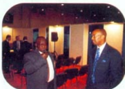
Director of Marketing FRCN with MD, Notore