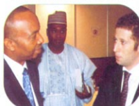
MD, Notore, MD, Global Corp with an European agric Investor