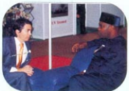
MD, Global Corp with an Investor