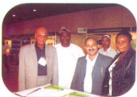
Gulf Investors at Nigeria Pavilion