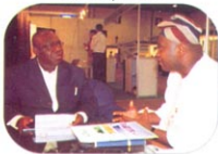
Director of Marketing FRCN with MD, Global Corp