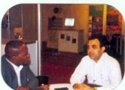
ED, Global Corp with an Investor