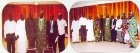
Group Photograph of Executives of Global Corp and AFAN Members

Global Corp and AFAN South West Zone have met twice post-AGRAME (May 8-9 and May 29-30, 2009) to strategize on how to advance and modernize agriculture in the South West and position agribusiness in the region to focus more on export commodities, (such as organic cocoa, beef and dairy products, wheat, barley, rice, pineapple, citrus, oil palm, cashew, cassava and its derivatives, and raw materials for bio-fuel) for markets in the Middle-East and European Union.