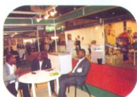
Nigerian Contingents at Nigeria Pavilion