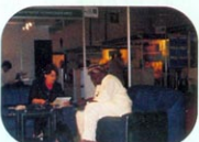
MD, Global Corp with an Investor