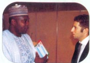
MD, Global Corp with an European Investor