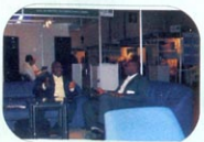
Director of Marketing FRCN and ED, Global Corp