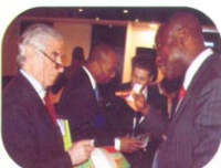
AGRICOMA Official with Notore representative