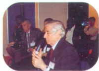
AGRICOMA Official asking MD Notore questions on Nigeria agricultural climate