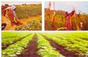
Agriculture in Sudan

The potential opportunities from AGRAME are enormous for Nigeria's agric sector. In fact, Brazil, Vietnam, Malaysia, Kenya, Australia and Turkey are making billions annually in agric exports to the Middle East. So can Nigeria!