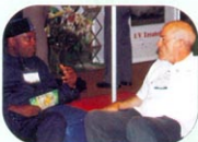
MD, Global Corp with an Investor